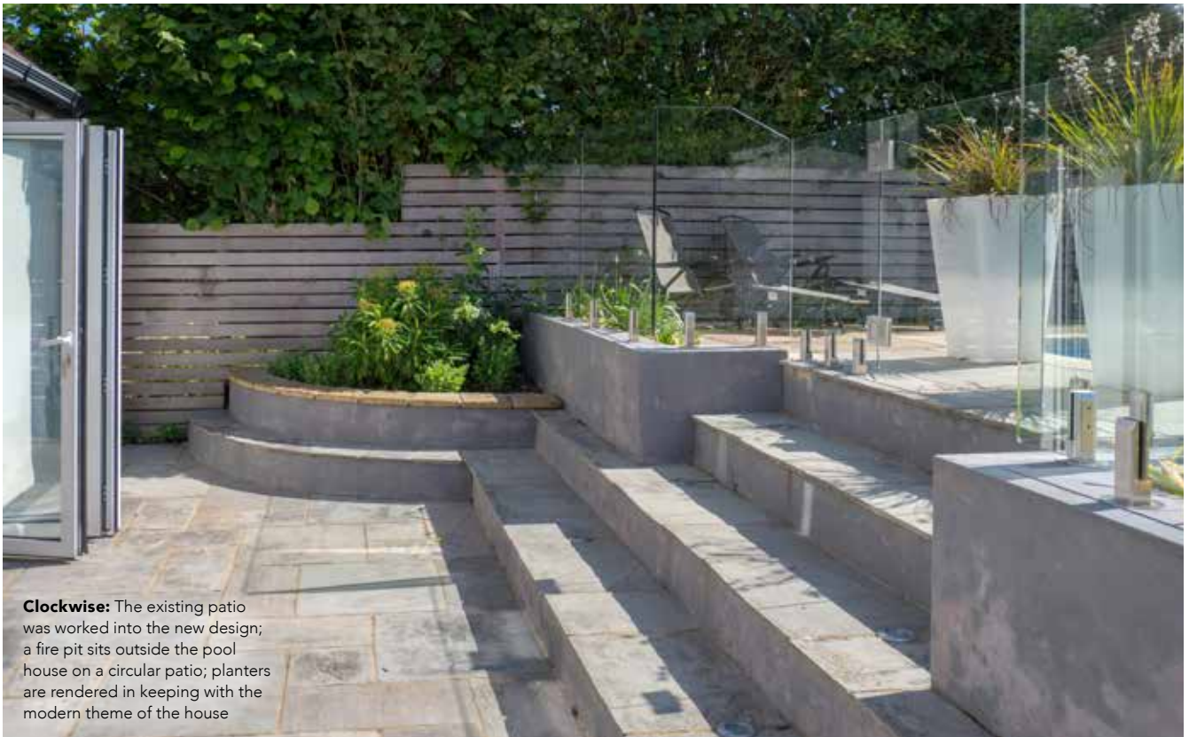
Clockwise: The existing patio was worked into the new design; a fire pit sits outside the pool house on a circular patio; planters are rendered in keeping with the modern theme of the house